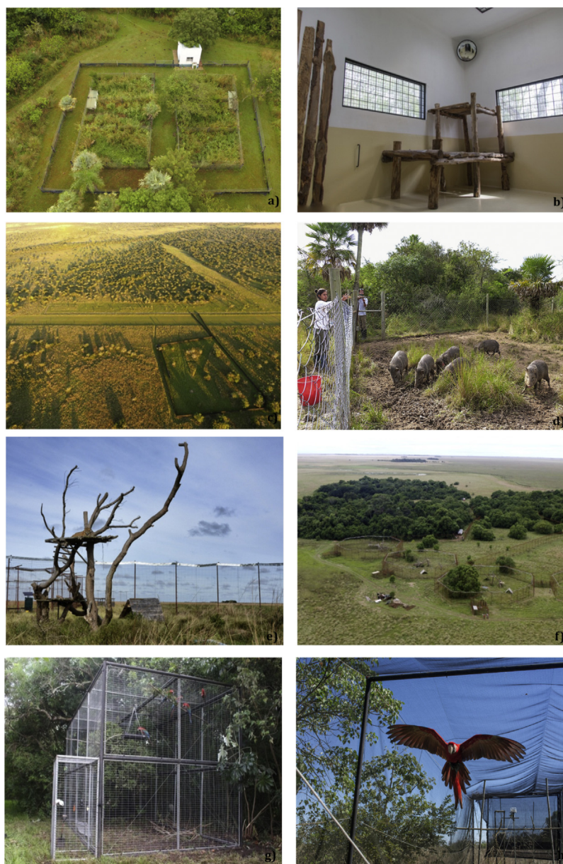
Fig. 2. Part of the Rewilding project infrastructure. (a) Giant anteater rescue center with six pens. (b) Jaguar quarantine facility. (c) Pampas deer pre-release pen (below) and sanctuary (above). (d) Peccary, anteater and tapir pre-release enclosure. (e) One of the breeders facility in the CECY. (f) View of the enclosures for jaguar breeders and larger enclosures for mothers and offspring at the CECY. (g) Green-winged macaw's shelter cage. (h) Green-winged macaw's flight tunnel.